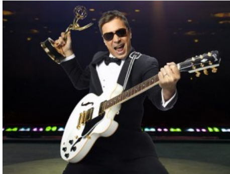
Jimmy Fallon Hosts the 2010 Emmy Awards

Big winners in key categories included first year comedy " Modern Family " (ABC) with six Emmys , which beat out heavily-nominated "Glee." Fox's musical comedy, which began the night with nineteen nominations, eventually took home four awards. AMC's " Mad Men " took home the Emmy for TV's best drama for the third consecutive year.