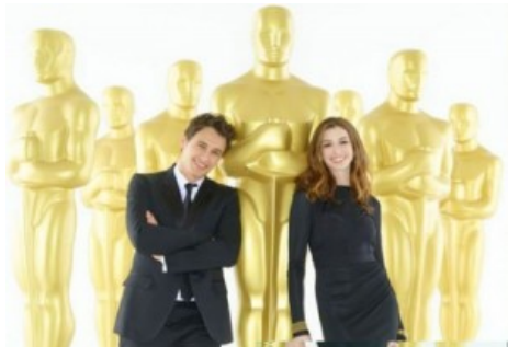
Hosting the Oscars: James Franco and Anne Hathaway

amusing opening montage where hosts James Franco and Anne Hathaway were transported through vignettes of best pictures nominees (including Anne Hathaway dressed up as The Brown Duck in a spoof of The Black Swan ), the awards moved along smoothly and with several notable appearances, including Kirk Douglas who hammed it up to the delight of the crowd before presenting the award for best supporting actress, former host Billy Crystal , a vintage clip of Bob Hope offering his classic dry wit during a broadcast from the 50s, the annual In Memorium tribute to passing industry stars accompanied by Celine Dion signing "Smile," and a finale that included a performance of " Over the Rainbow " by school kids from New York's PS-22.